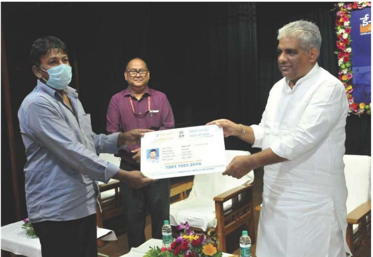
The Union Minister also presented approval letters for ESI COVID-19 Relief Scheme to dependents of 11 workers who lost their lives to COVID-19.